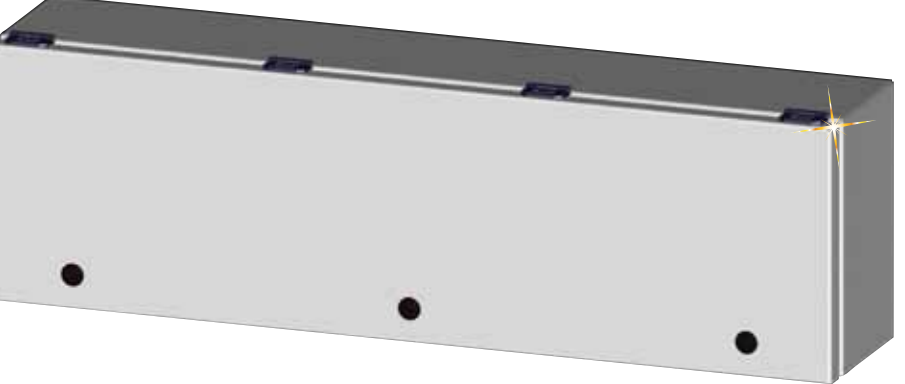
SCE-L9126ELJ electrical junction enclosure shown smaller than actual size.