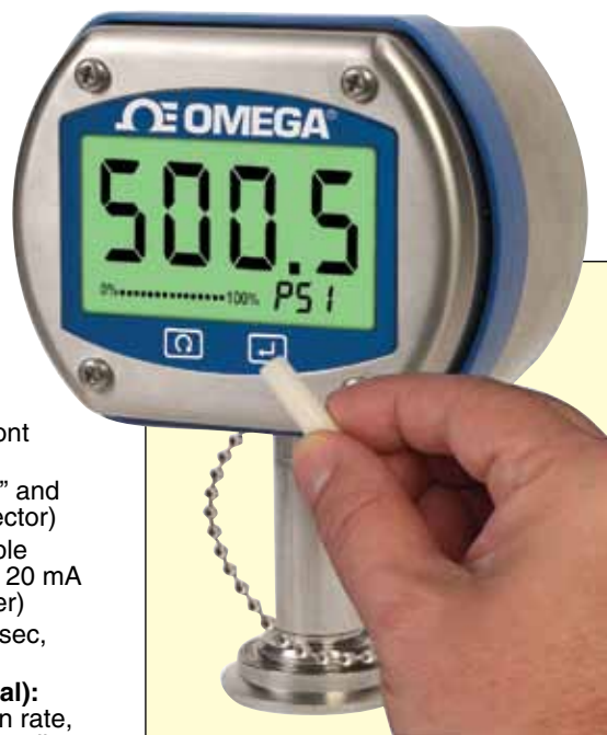
DPG409S15-500G, shown smaller than actual size.

Weight: 900 g (2 lb) Typical depending upon configuration