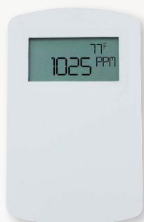
North American style wall mount