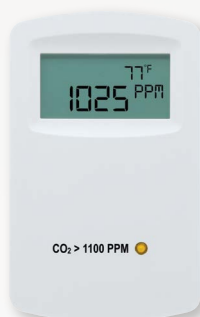
DSA* compliant option -S