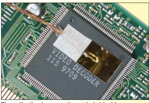
The self-adhesive mounting strip is ideal for "targeted" placement of the sensor element. Once the element is in place, it can be used "as is", for applications such as electronic component temperature monitoring during board fabrication. It can also be cemented in place using OMEGABOND® for higher temperatures.