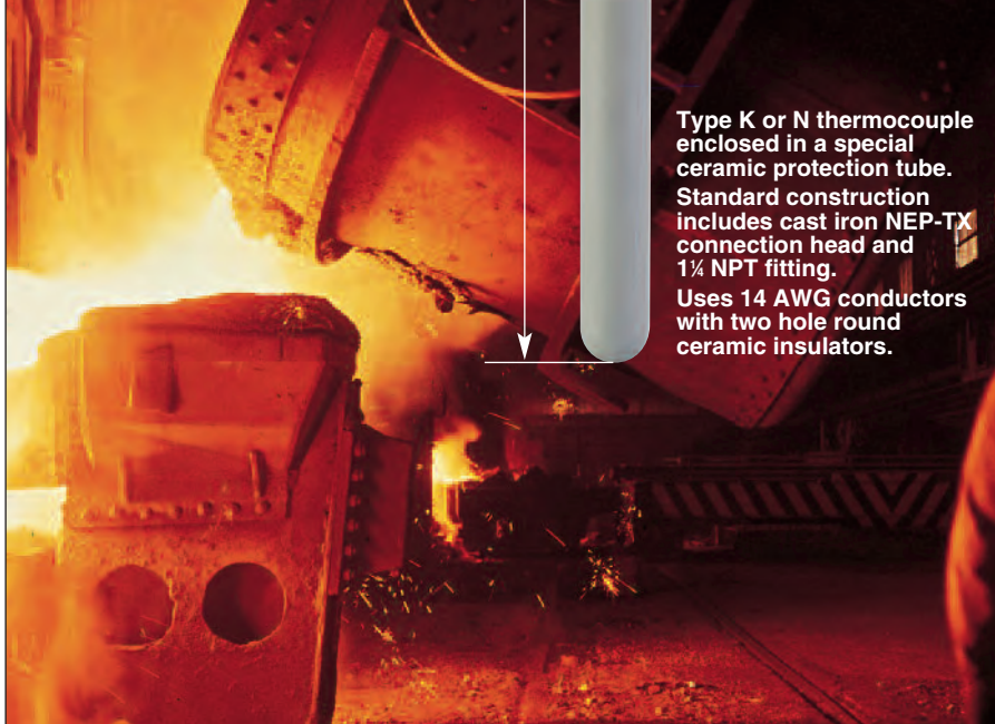
AVAILABLE FOR FAST DELIVERY!