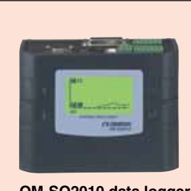
OM-SQ2010 data logger, visit us online.