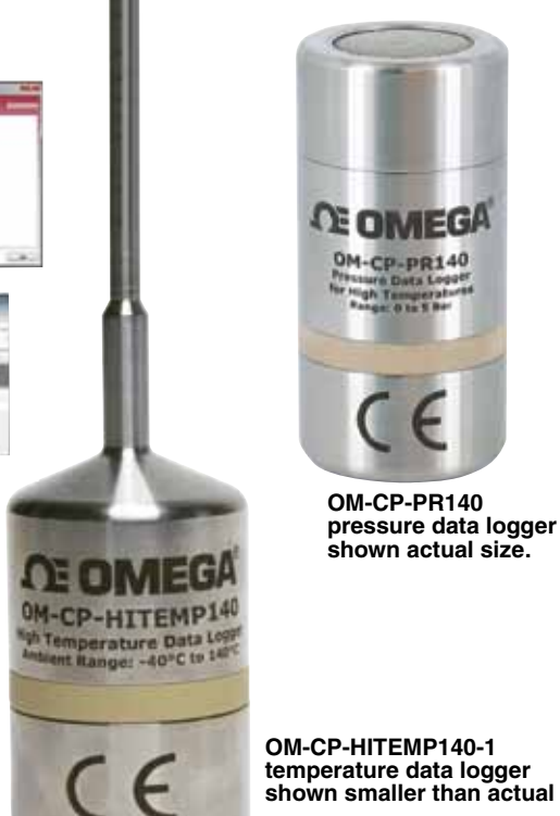
OM-CP-HITEMP140-1 temperature data logger shown smaller than actual size.

Time Accuracy: ±1 minute/month at 20°C Operating Environment: -20 to 140°C, (-4 to 284°F) 0 to 100% RH, may be used above 60°C (140°F) for up to 8 hrs per 24 hr period Dimensions: 50.8 L x 25.4 mm dia. (2.0 x 1.0") Weight: 85 g (3 oz) Enclosure: Stainless steel