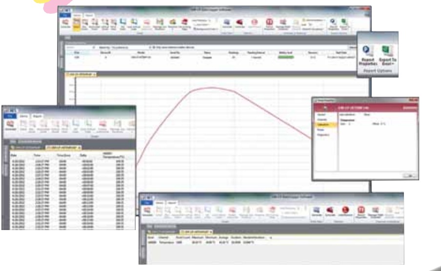
FDA 21 CFR part 11 secure software included.